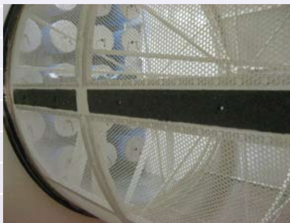
Figure 3 - Zip Channel Covers Installed

Verify that the zip channel COVERS are installed. The zip channels are not used to retain the zippered media, but the covers must be installed to provide a smooth surface for the media. Figure 3