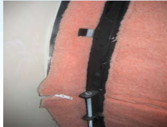
Figure 7 - Media tucked over Seal