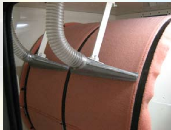
Figure 9 - Zippered Media Installed