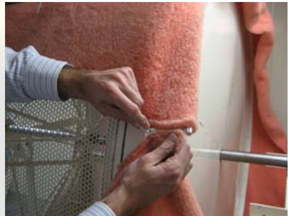
Figure 5 - Starting Zipper

Pull the ends of the media together, and start zipper. Figure 5