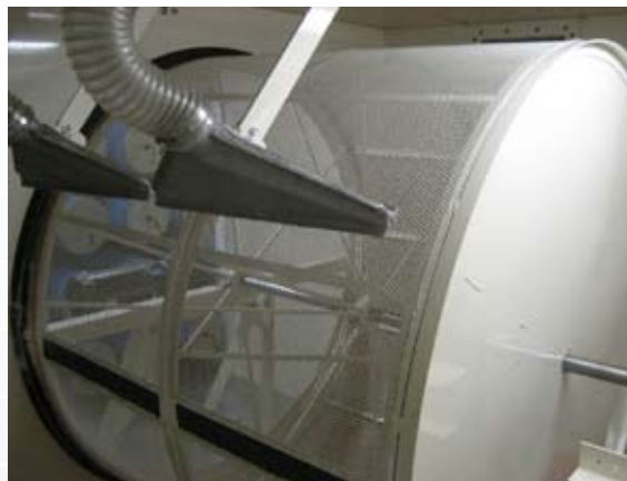
Figure 1 - Drum Cages Without Media

Remove the old filter media from the drum cage sections. If hanging nozzles are used: RAISE the nozzles away from drum cages to provide clearance for installing media. There is a hole in the nozzle mounting bracket for this purpose: Insert a pin through the hole to temporarily hold the swing arm in the raised position. Figure 1