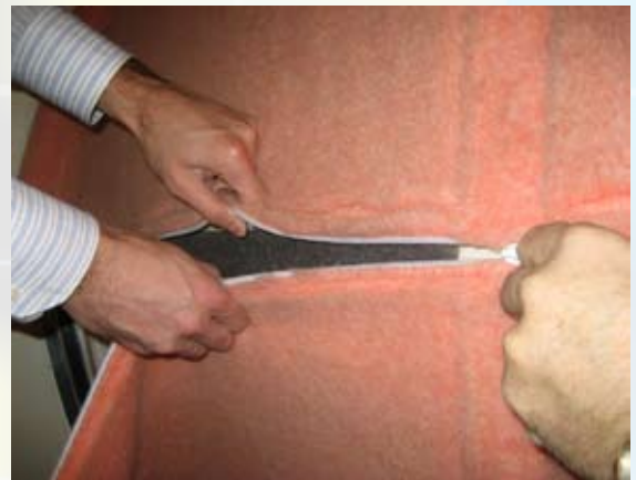
Figure 6 - Zipping Media