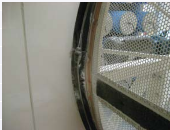
Figure 2 - Drum Seals Installed

Verify that the Primary and Secondary seals are properly installed. Refer to the Osprey Drum Filter Manual for information on installing the seals. Figure 2