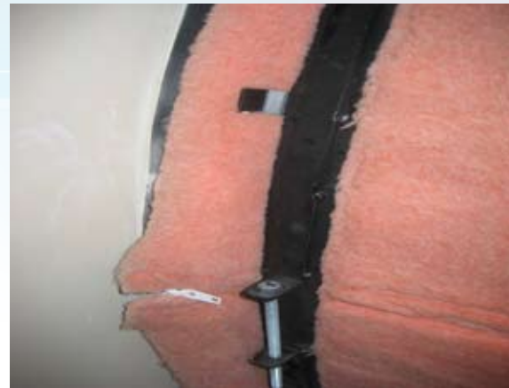
Figure 8 - Media tucked over Seal