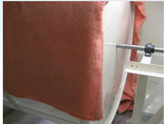
Figure 5 - Media Wrapped on Drum