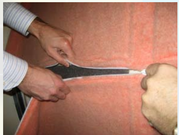
Figure 7 - Zipping Media